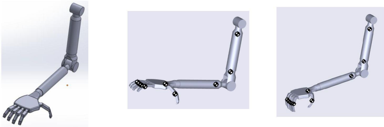
Fig 5: Solid Design of the computer interface and the Simulink simulations – by: B.C. Kahraman-ongoing study